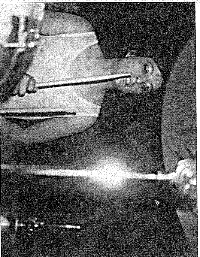
Kamala, Cringer, NYC, '91

Gerry had a letter printed in a benefit single put out